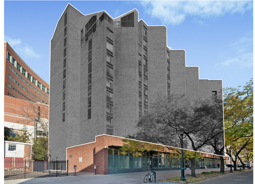
*Shaded is a 300-unit property for senior living/senior residents that sits above 801 Locust Street

Surrounded by luxury residences, high-end restaurants, and shops, this office is the perfect choice for healthcare professionals seeking a premium location to serve Philadelphia's vibrant community.